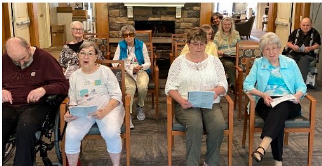
Harrison Bay congregation

These past nine months I taught 9 college courses at 4 different schools traveling over 12,000 miles to plant seeds of the Kingdom in the hearts and minds of some 250+ students. Alongside my academic lectures, I seek out students who may need a pastor more than a professor at the moment. Some student testimonies: